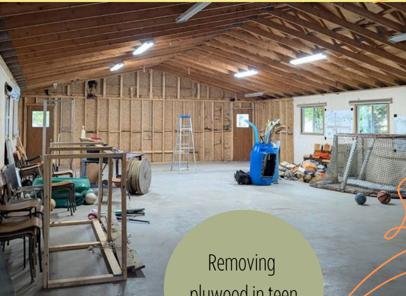
Removing plywood in teen classroom

Metal roof on the washrooms, build a sports equipment shed, plumbing & electrical, ice storm tree maintenance! Bring your chainsaw!!